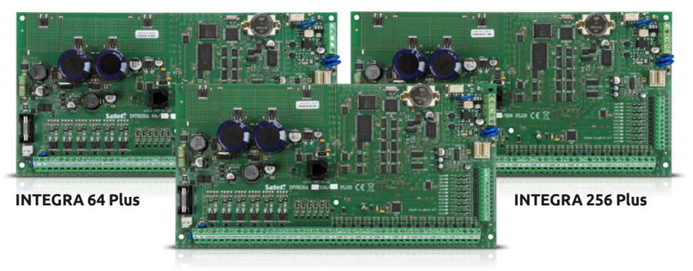
INTEGRA 128 Plus

In addition to detecting and signaling an attempted intrusion or hold-up, these devices also offer simplified access control functions and the ability to implement building automation.